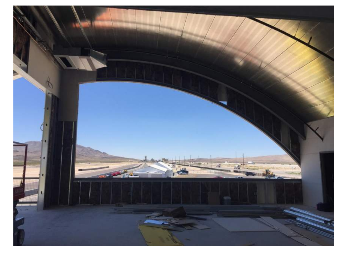
Exhibit H (Below): Contractors work on the interior fit-out during the final phases of construction. Note the curved HSS beams at the top of the photo and clear space to below.

Exhibit G (Left): Cross-section showing the curved HSS beam and spacing of two HSS columns supporting both cantilevered eaves.