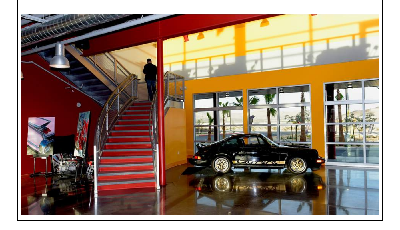
Exhibit D (Below): View of the completed interior space with pre-fabricated metal stair showing the cantilvered W beam supporting the second level above off the HSS column (top left corner).

Exhibit C (Above): View of the clubhouse building from the pit lane highlighting the curved roof, cantilever deck and garage-style windows facing the course. Rendering courtesy of the Gruskin Group.