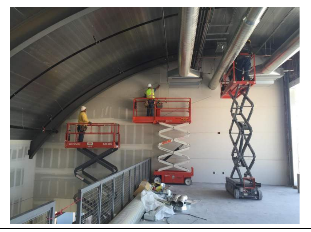
Exhibit F (Below): Contractors work on the interior fit-out during the final phases of construction. Note the curved HSS beams at the top of the photo and clear space to below.