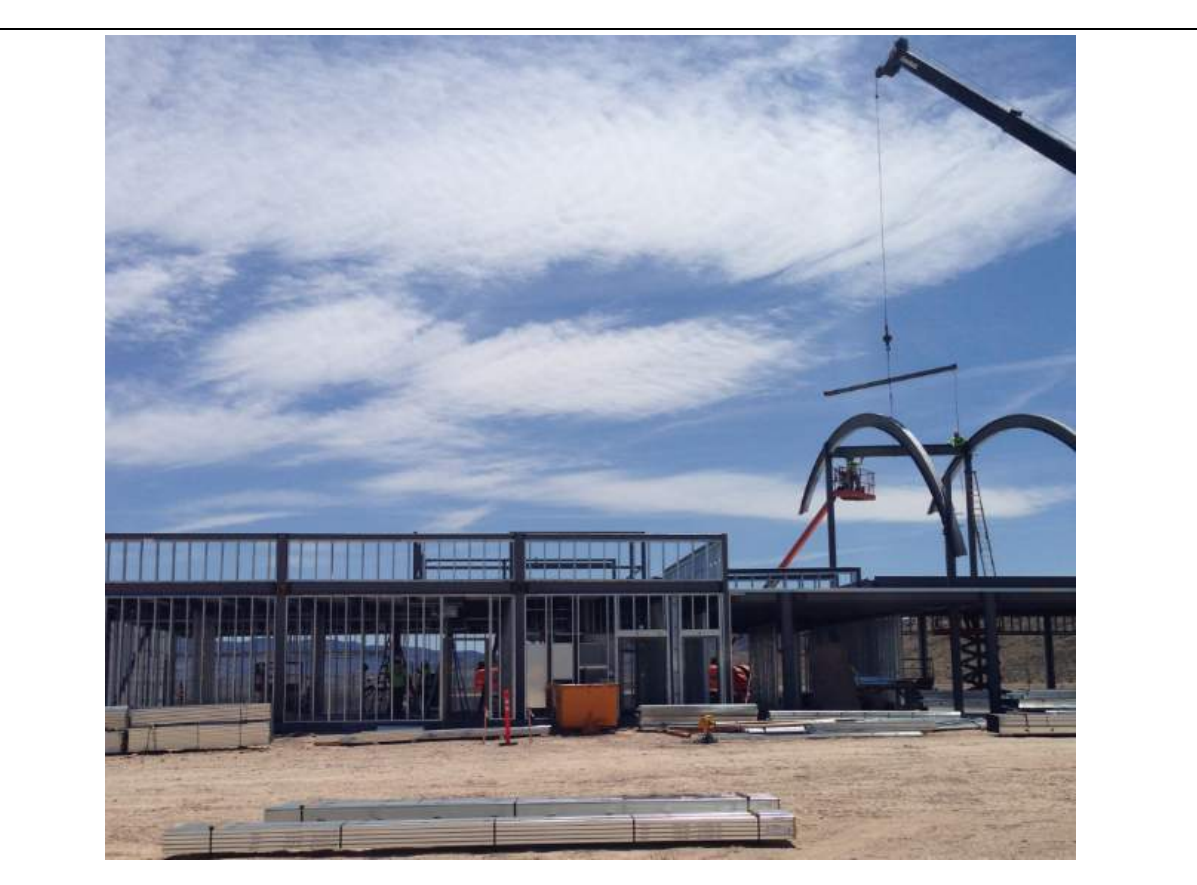
Exhibit I (Above): Ironworkers erect one of the purlins supporting the roof. The frame showing the steel walls of the garage and the large clear span of the ground-level space (lower right). Exhibit J (Below): Contractors finalize the exterior siding after pouring the second level slab and installing the roof panels in preparation for the fabric covering.