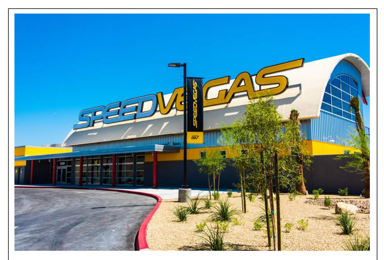
Exhibit A (Above): Exterior view of the completed race course clubhouse showing the rear of the fabric roof, Speed Vegas sign, and the leading edge of the curved eave (right background). Exhibit B (Below): Overhead 3D rendering of the parking lot, entrance drive aisle, clubhouse, garage and sheltered motorsports rest area.