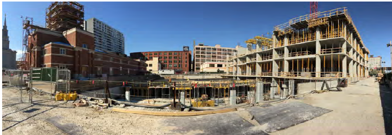
Drive through between Meeting House and Tower