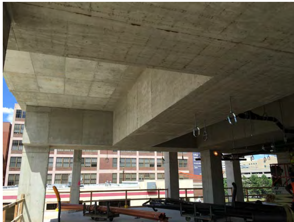
Bottom of Transfer Girders after completion