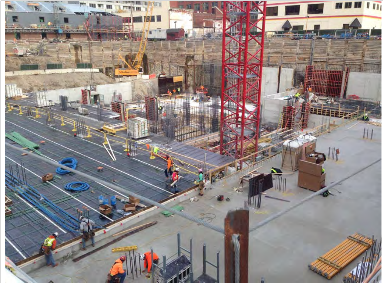
Post-tensioned parking levels