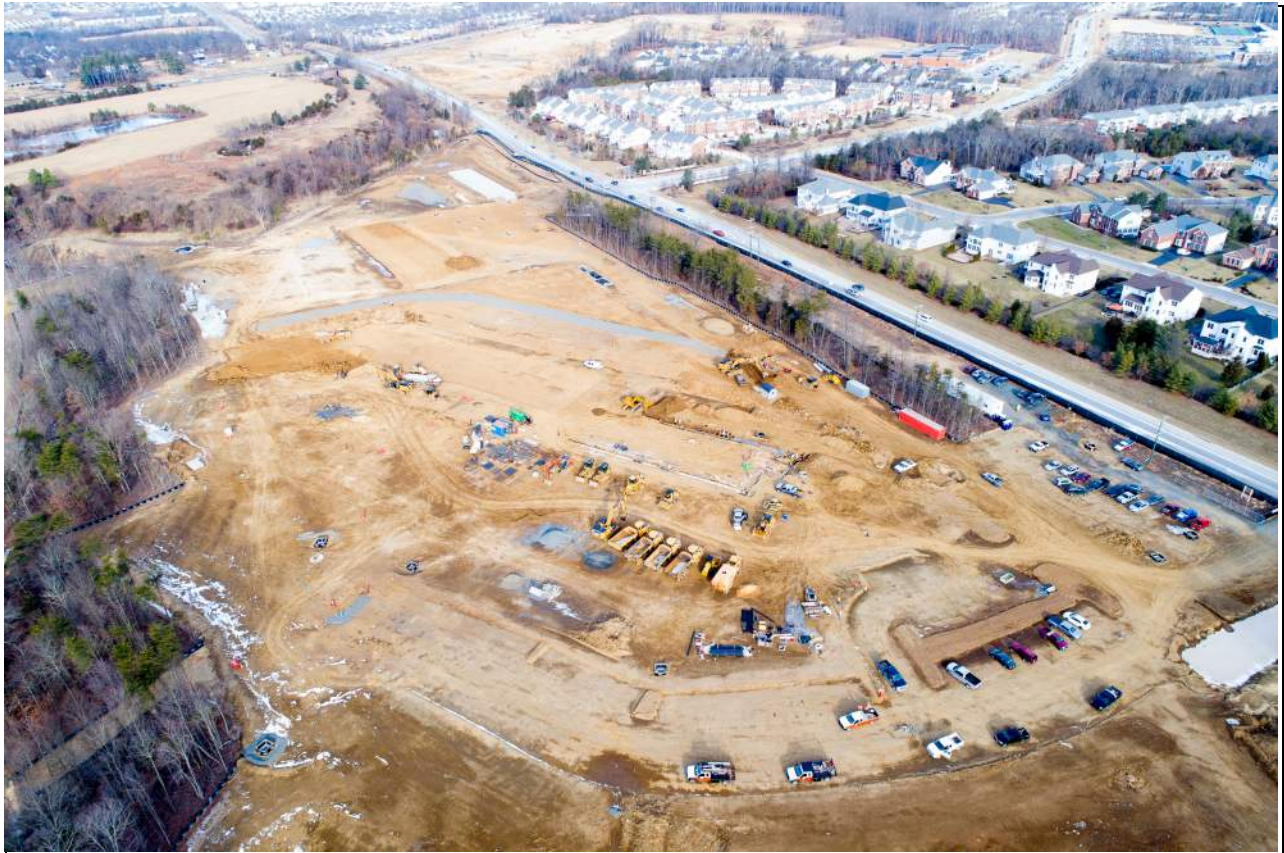
Above image: Drone photo of site taken while working on foundations. Below image: Forms being installed for cast in place concrete wall.