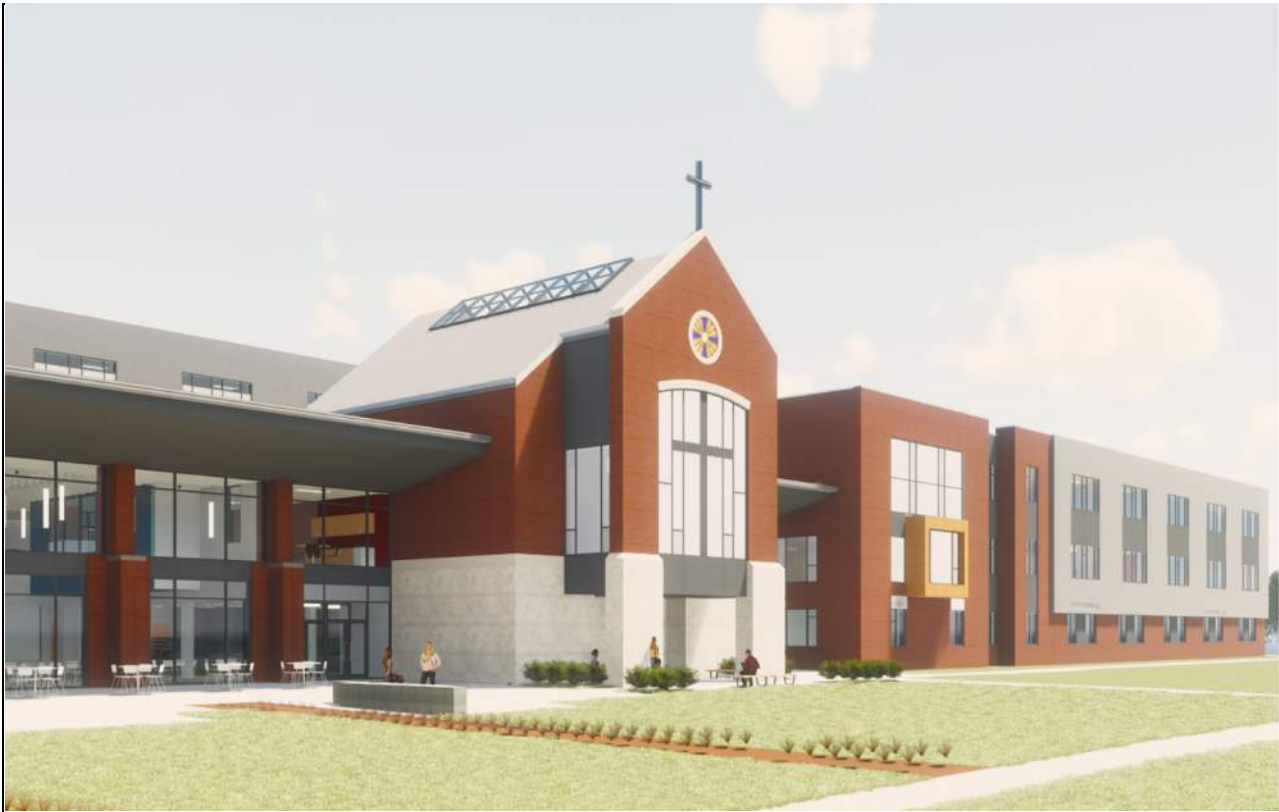
Renderings courtesy of VMDO Architecture.