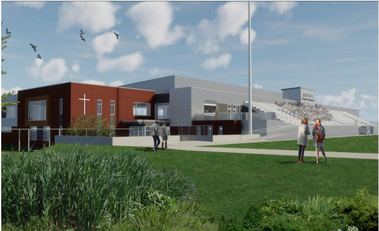
Renderings courtesy of VMDO Architecture.