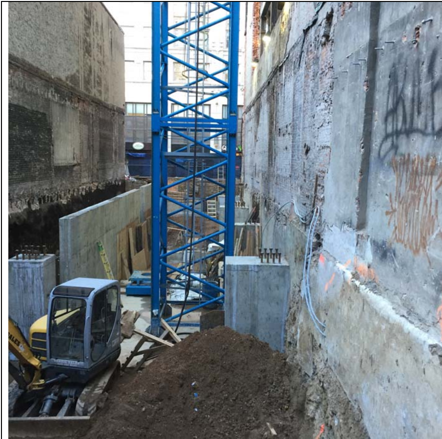
Extremely tight urban site with tower crane