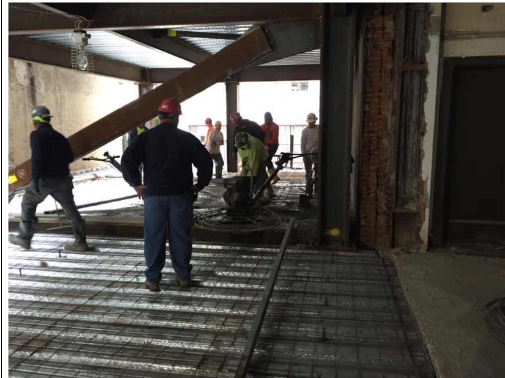
Close surveying allowed for tight construction