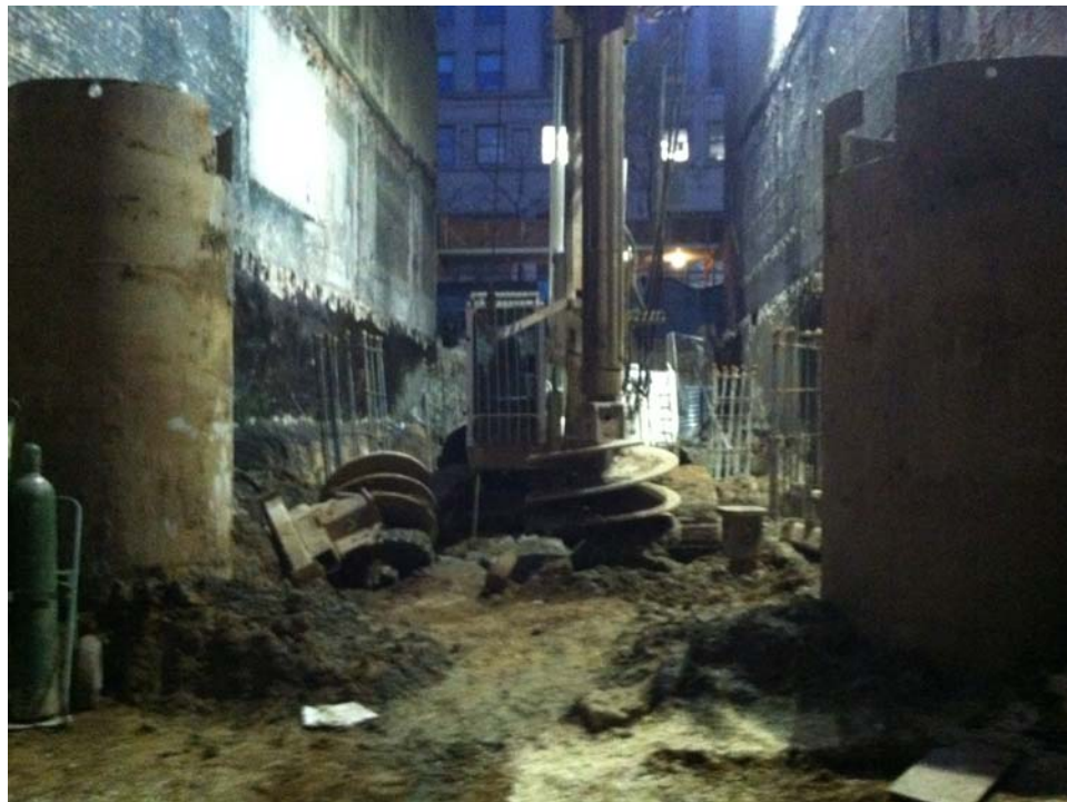
Caisson drilling rig at the bottom of the